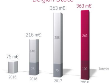
Dividend of 363 million euros for the Belgian State

At the end of 2018, the Basel III CET 1 (Fully Loaded) ratio was 16%, which is an excellent level. The Solvency II ratio for Belfius Insurance was 203%, keeping it one of the highest in Europe. Due in particular to the strong growth in operational activity, Risk-weighted assets rose by 2% to 52.1 billion euros.